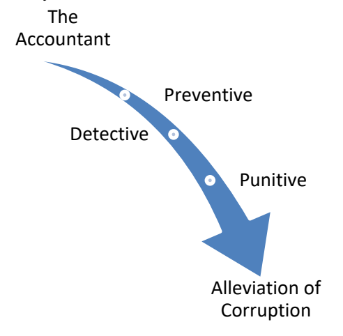
Figure 2: Role of the Accountant in Fighting Corruption

The Accounting profession has a tripod dimensional role in the alleviation of corruption. These dimensions are preventive, detective, and punitive in nature.